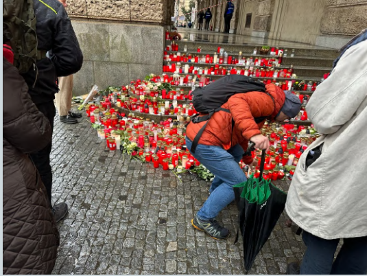
A memorial the the shooting victims at Charles University