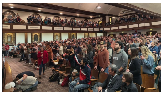
The Asbury Revival today

When we entered the chapel, God's peace, joy, and love were palpable. So many people, especially college students, are worshiping, praying for one another, encountering God, and surrendering their lives to him. It's so precious to be here right in the middle of this Jesus-centered revival before we return to Europe. This has been a time of refreshing for us, a reminder that God loves and visits his people.