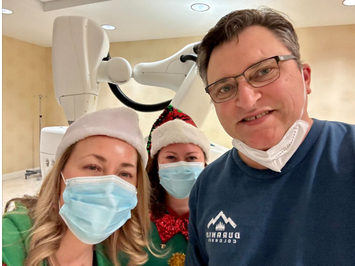
Just after my last radiation treatment just before Christmas. The staff were dressed as elves, played Pomp and Circumstance, and gave me a diploma!