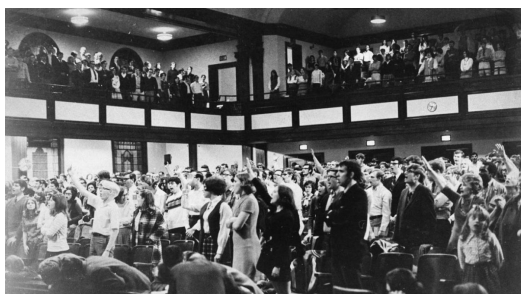
The Asbury Revival in 1970

Amidst our preparations to go, the Holy Spirit is moving at Asbury University just across the street from the seminary in a special way. In 1970, a student chapel at the university continued day and night for 144 hours. This is known as the Asbury Revival . Just last Wednesday, it happened again and the “chapel service” is still going as it seemed that no one wanted to leave. A deep sense of awe settled over the place, and people continued to worship. Thousands have attended.