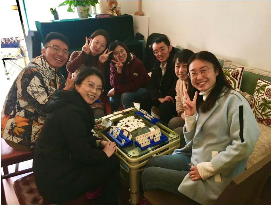
Having fun with some of our Christian family