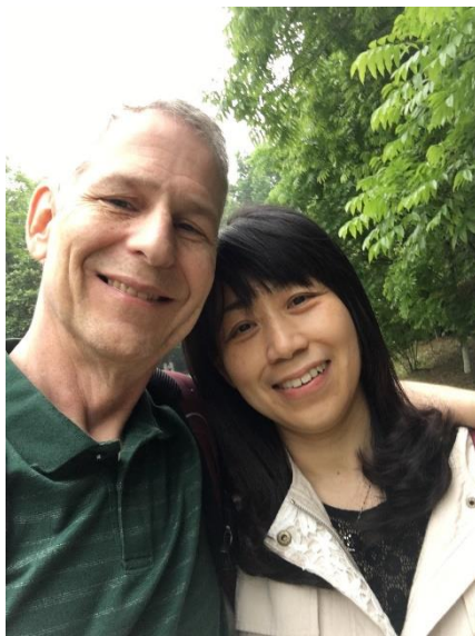
This selfie was taken when we first met in May of 2016