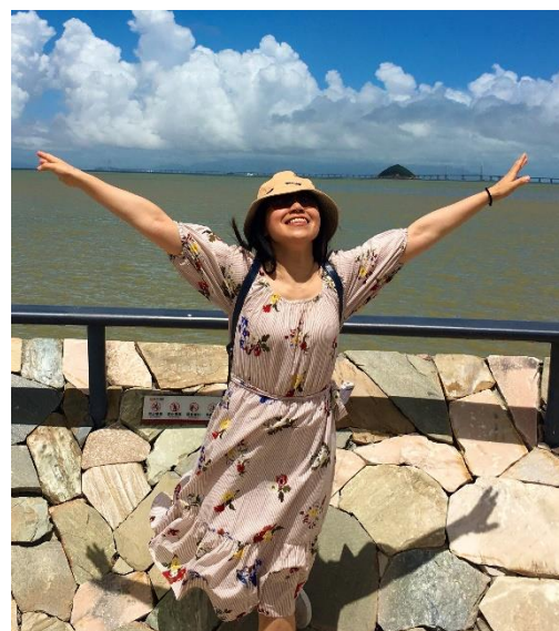
My wife – Praising God during our troubles in Zhuhai

We should “fix our eyes” not on what is seen – our difficulties, trials, and pain; but on the “unseen”. What would that be? The strength and love of our Father. Seeking His wisdom and His plans for us, and trusting that our troubles will be used of God – teaching us, giving us wisdom and eventually strength and courage as we walk through these troubles. This is an eternal glory – our character getting better, our patience growing, our perseverance growing, and our faith and trust in Dad growing. This has been my life since I moved here. Troubles and difficulties – leading to growth in Faith and perseverance. It’s not easy, but it was necessary.