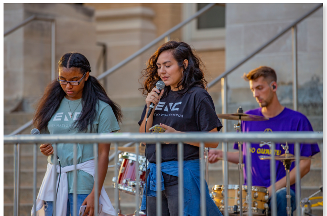
Worshipping Jesus and praying for racial reconciliation