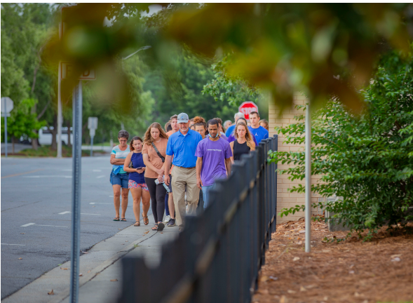
Prayer and Reflection walk around court house

Even with these convictions and a diverse community, after the death of George Floyd, our relational cords were tested. The New Testament tells us that storms reveal foundations (Luke 6) and fires reveal our work (1 Cor. 3). I am so grateful to Jesus and the amazing leaders around us that we have been able to respond in this moment with hope and movement forward for the Glory of God. Our church and campus ministry led a Worship and Prayer walk on the steps of the Pitt County Court House. The wind literally blew through our time the entire night. It was a little bit surreal. The reconciled Church took another step forward in walking out the Gospel, as the light of Jesus shown forth in our city in these dark times. I believe tougher times may be coming. Please continue to pray for our church, city and nation for revival and Gospel renewal to precede reformation. External change, though important, without rebirth and heart change will only be short-lived. We need God to move like never before!!!