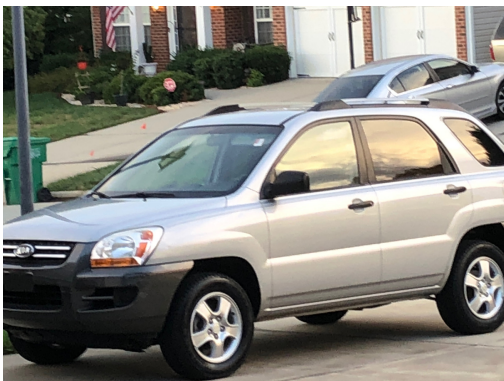
This is my new car, same KIA but different color.

As I was in the process of getting a new car and having my laptop fixed I realized God was teaching me about restoring and renewing my soul. During those days, I was deeply soaking in the Bible and I felt so alive in God's presence. I learned to be at rest during my busy season.